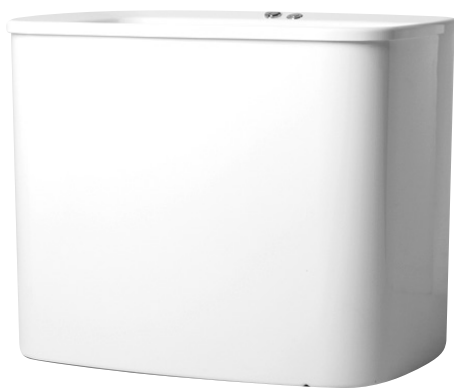
Pastille 1140 x 810 x 820mm Spa Bath Custom made to order